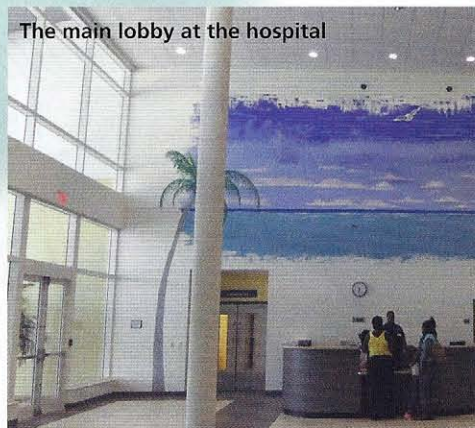
The main lobby at the hospital

Thinking of taking a Medical Vacation? It's an idea I'd never have considered thirty years ago. But as the traveling public gets older, it's an idea that is coming of age. Nevertheless, most people would rather not have to go through hospital doors while away, but it is oh so reassuring to know that should that occasion arise, there are trained staff and excellent facilities to take care of what ails you. ■